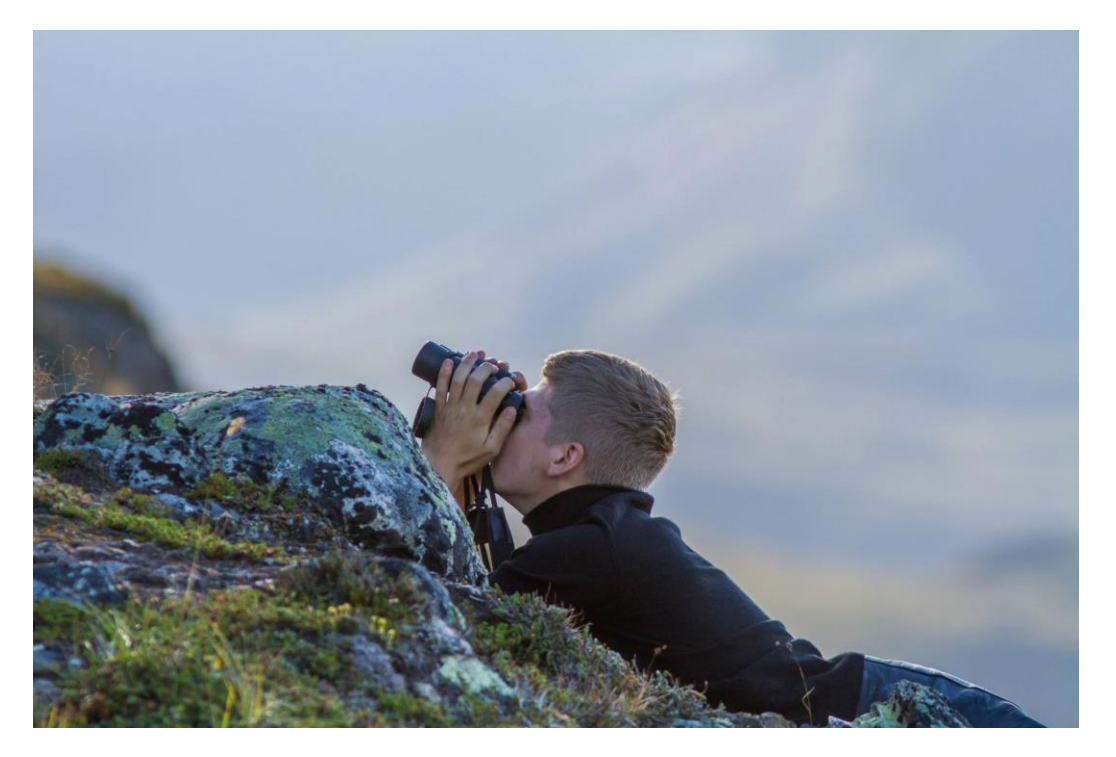
Fig. 1. A young citizen observing birds.

Document.pdf?_nc_cat=111&_nc_ht=cdn.fbsbx.com&oh=80c13e10f5e27eb4c02f4a59ab70be4b&oe=5C 5FBC0D&dl=1&fbclid=IwAR34h8JbJ3Asq4p3a-jdbDj5t0xbawg-HOkgf3yXJHu0fMPGA-zXXVsSvSA