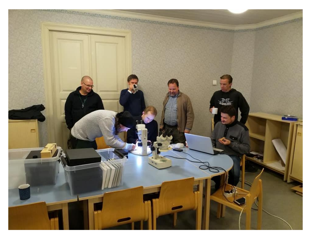
Fig. 3 . Experienced experts provide support for the beginners in species identification. Specialist group for true bugs (Heteroptera) has annual meeting in Helsinki.